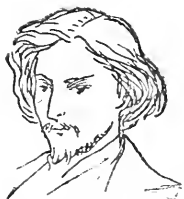
ALPHONSE DAUDET Aged 20 years.